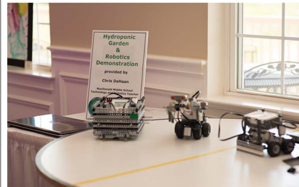
Two grants supported by your ELEF funds